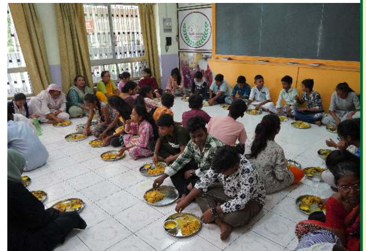
One Day Workshop – Values Education, Gender Equality and Indian Constitution