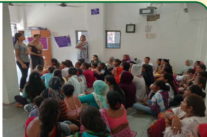
Empowering Adolescents: Health and Wellness Camp for Teenage Girls