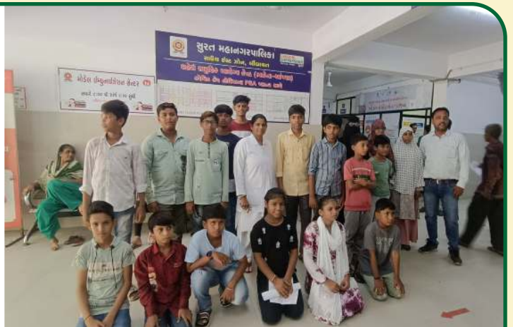
Visit to health center