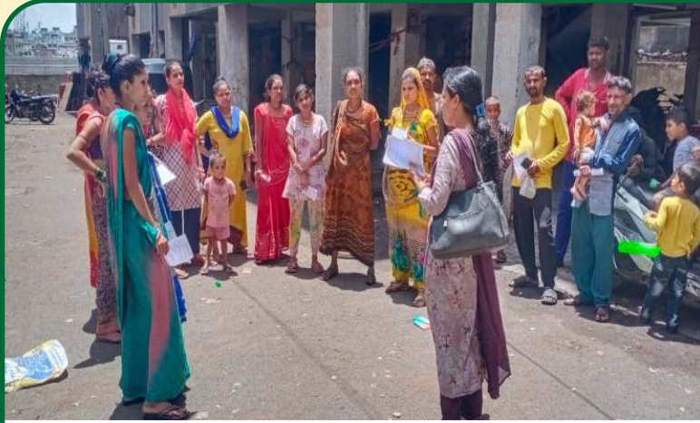
Spreading awareness among people about document proof