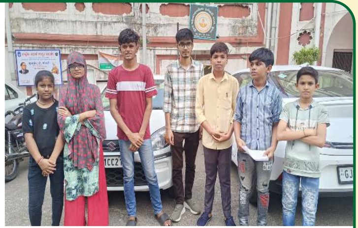
Children from the local community in Surat have taken the initiative to appeal to the authorities