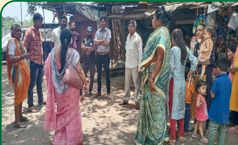
Legal guidance to people regarding housing