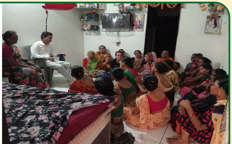
Navsarjan Empowers Citizens Through Legal Awareness Camps