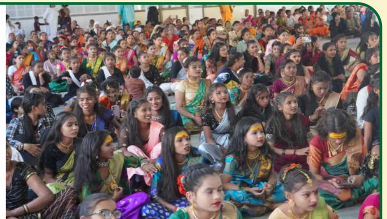
Celebration of International Women's Day