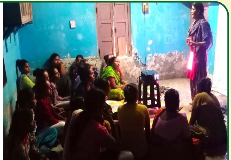
Camp for Teenage Girls