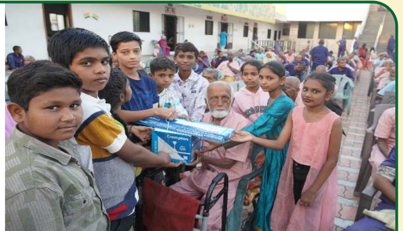
Picnic – Old age Home and Garden