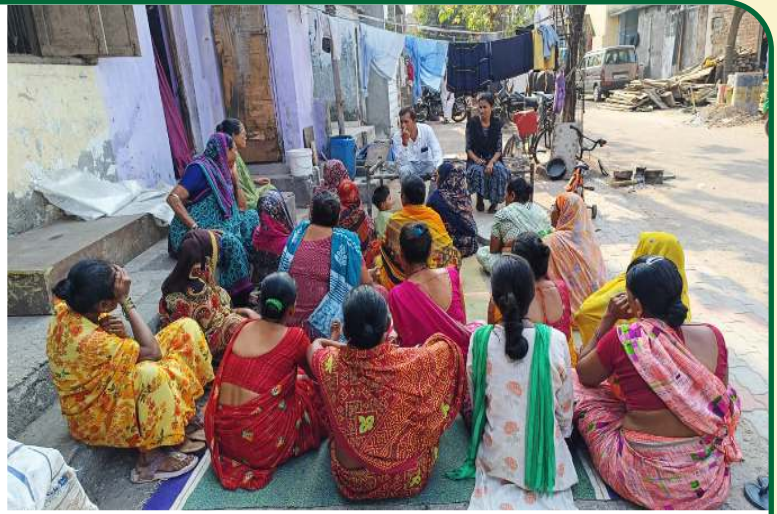
Legal Awareness Camps