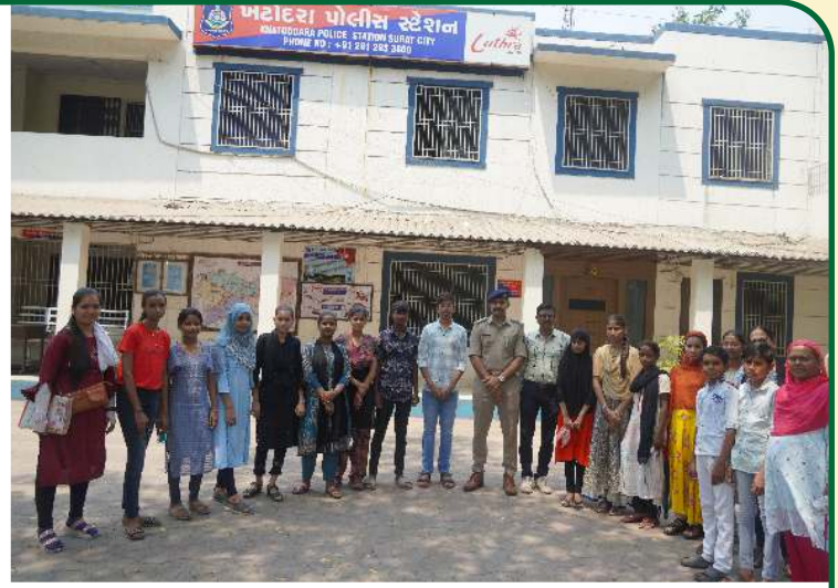
Police station visit