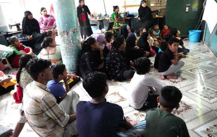
Training given by children