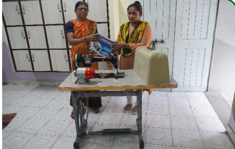
Bhagyalakshmi Credit Co-operative Society