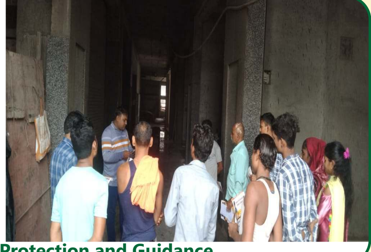
Migrant People – Protection and Guidance