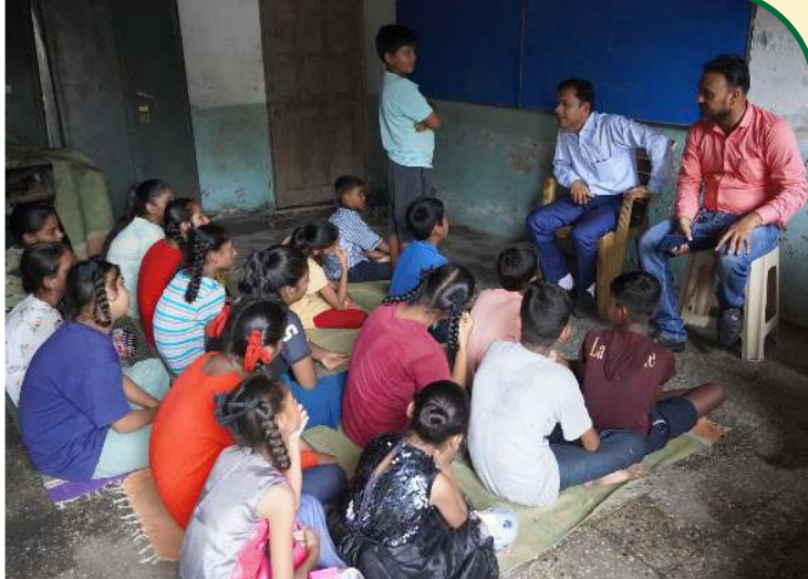
Talk with Successful People - by Lawyer

A total of 73 teenagers, including 47 girls and 26 boys, from the areas of Nagshennagar, Rasulabad, and Bhathena, received training from successful people (lawyers). The lawyers discussed with the children the importance of studying law and working hard to achieve success.