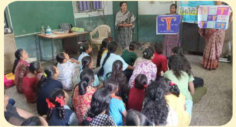
Adolescent Girls' Camp