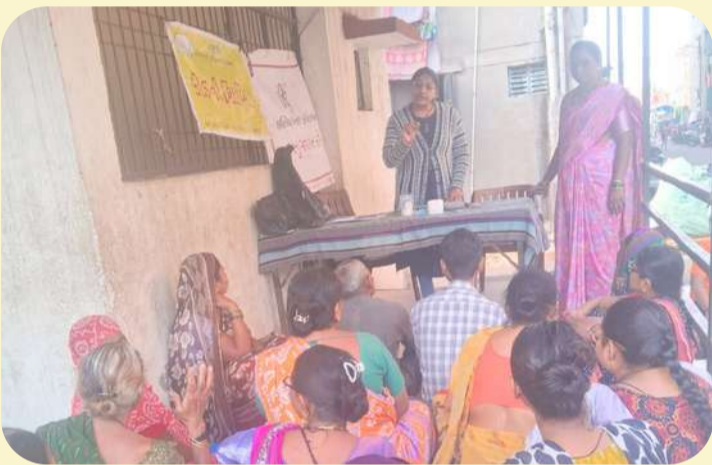
Kidney Awareness Camp