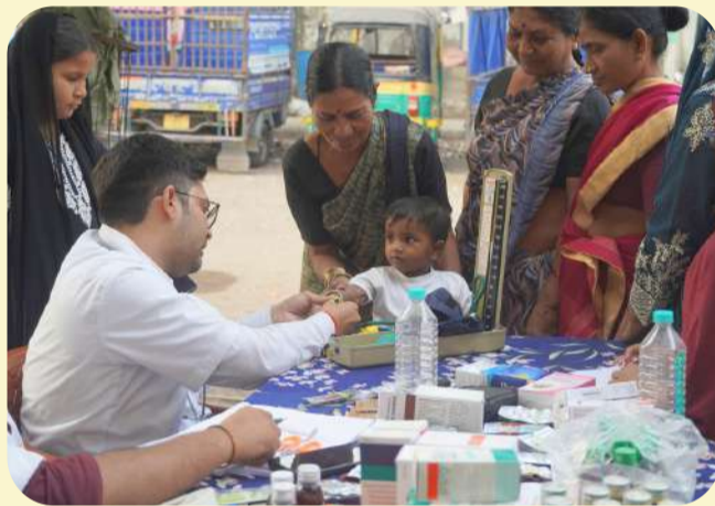
Health Check-up Camp