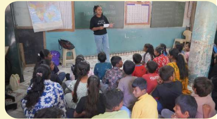
Children's Discussion Session