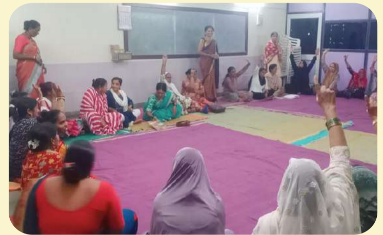
Meeting of Navchetna Members