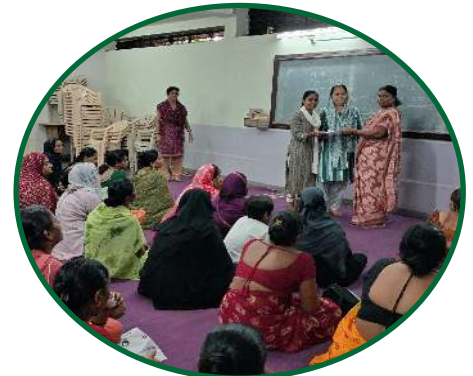
Training of members of the Navchetana