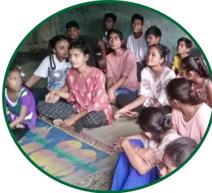
Meeting and Training with Youth