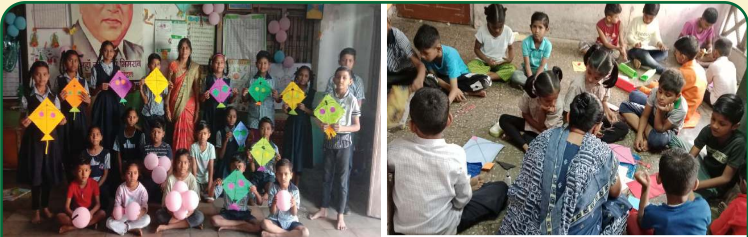
Celebration of Kite Day