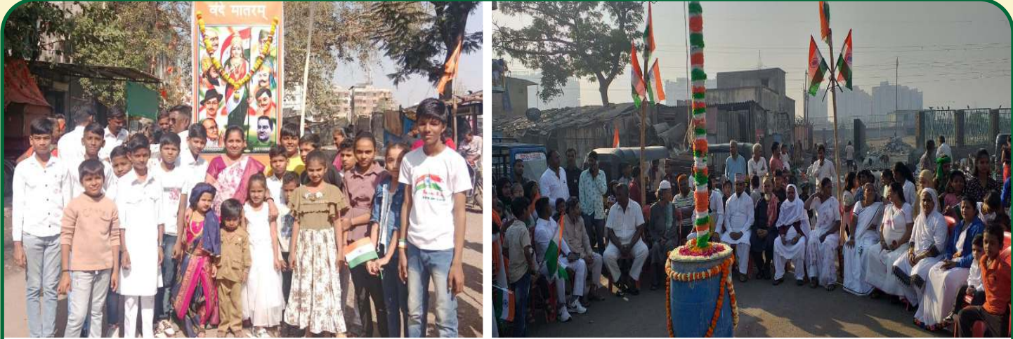
Celebration of Republic Day