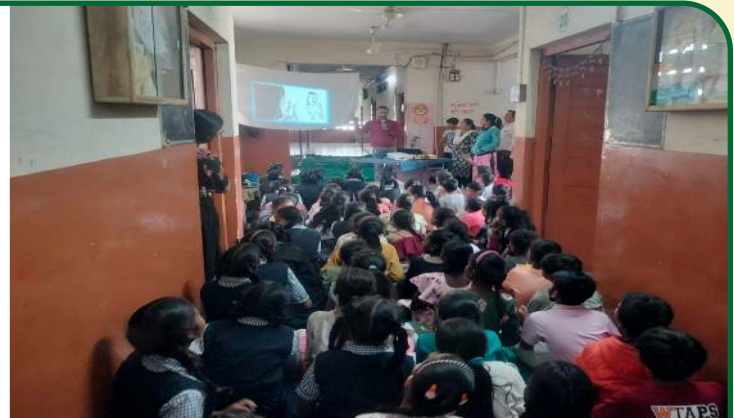
Navsarjan Empowers SMC Students with Important Trainings