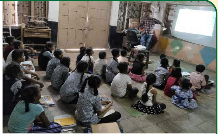
Navsarjan Inspires Young Minds with Preamble and Constitution Training