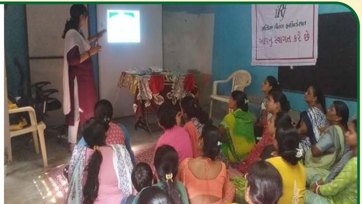
Kidney Disease Awareness Camp