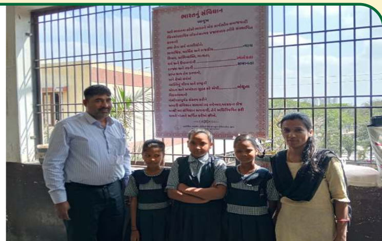
Navsarjan Inspires Schools to Foster Civic Awareness