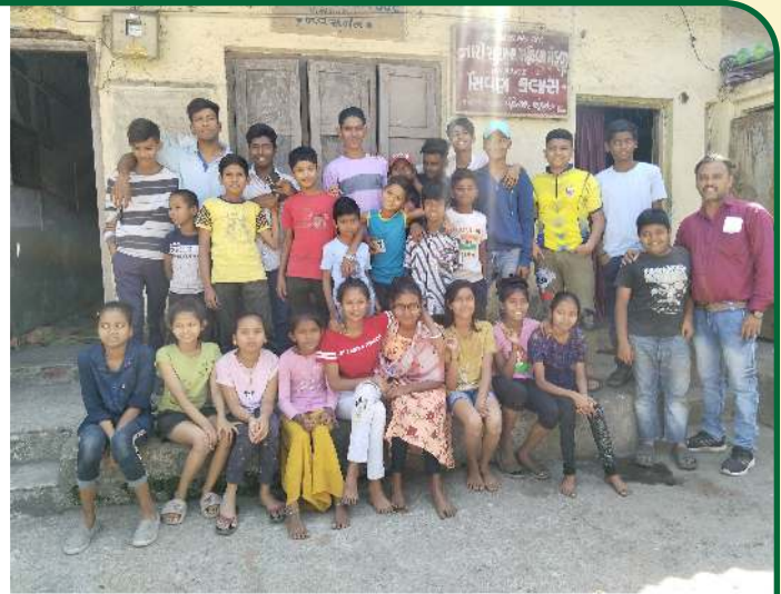
Navsarjan Empowers Adolescents Through Upcoming Trainings